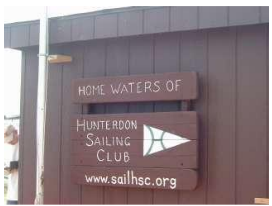
APRIL 18 LAUNCH DAY!

Daylight is lasting longer and we will be back on the water soon! Mark your calendars now for 'All hands on deck', Saturday April 18 (or rain date Sunday 4/19). That's the day we launch the See Witch One. Many hands are needed to lift her back in, and there are the usual spring commissioning tasks. Thanks to everyone's efforts last year the clubhouse and grounds are in pretty good shape, so spring clean up should go easier. Mayberry Sales has serviced the 2 Honda outboard motors, and we'll recharge our batteries so we are ready to go.